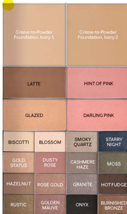
lighter skin tones