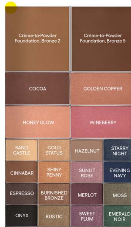
Deeper to very deep skin tones