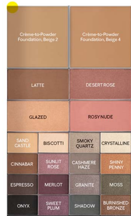
Medium to deeper skin tones